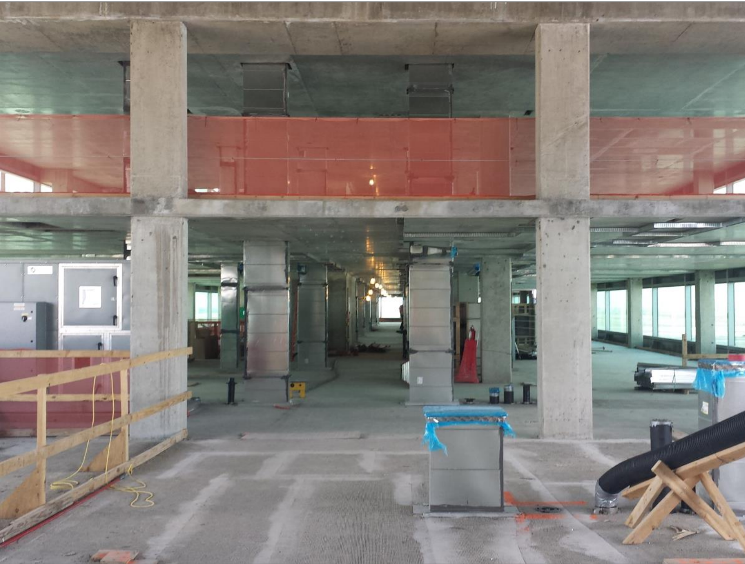
View inside Westin Hotel structure at Denver Airport, above train station