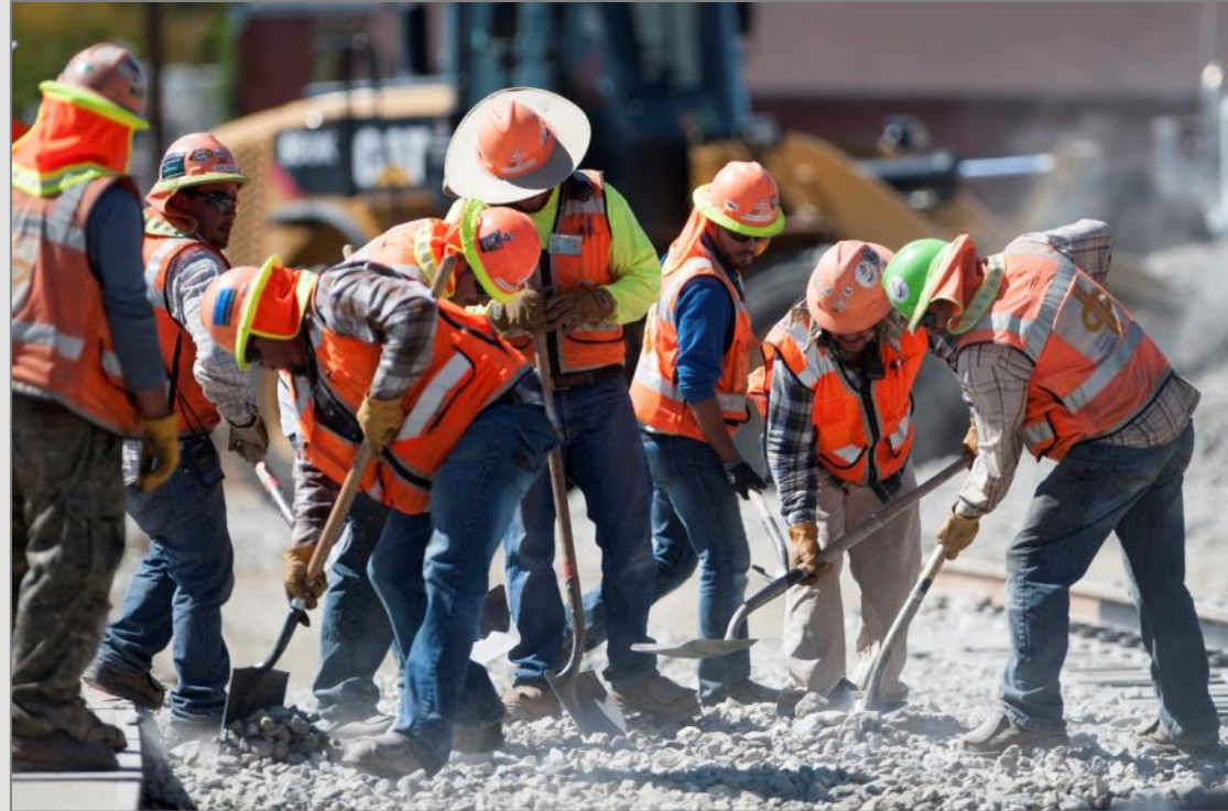
Crews place ballast along the commuter rail track near the Olde Town Arvada Station