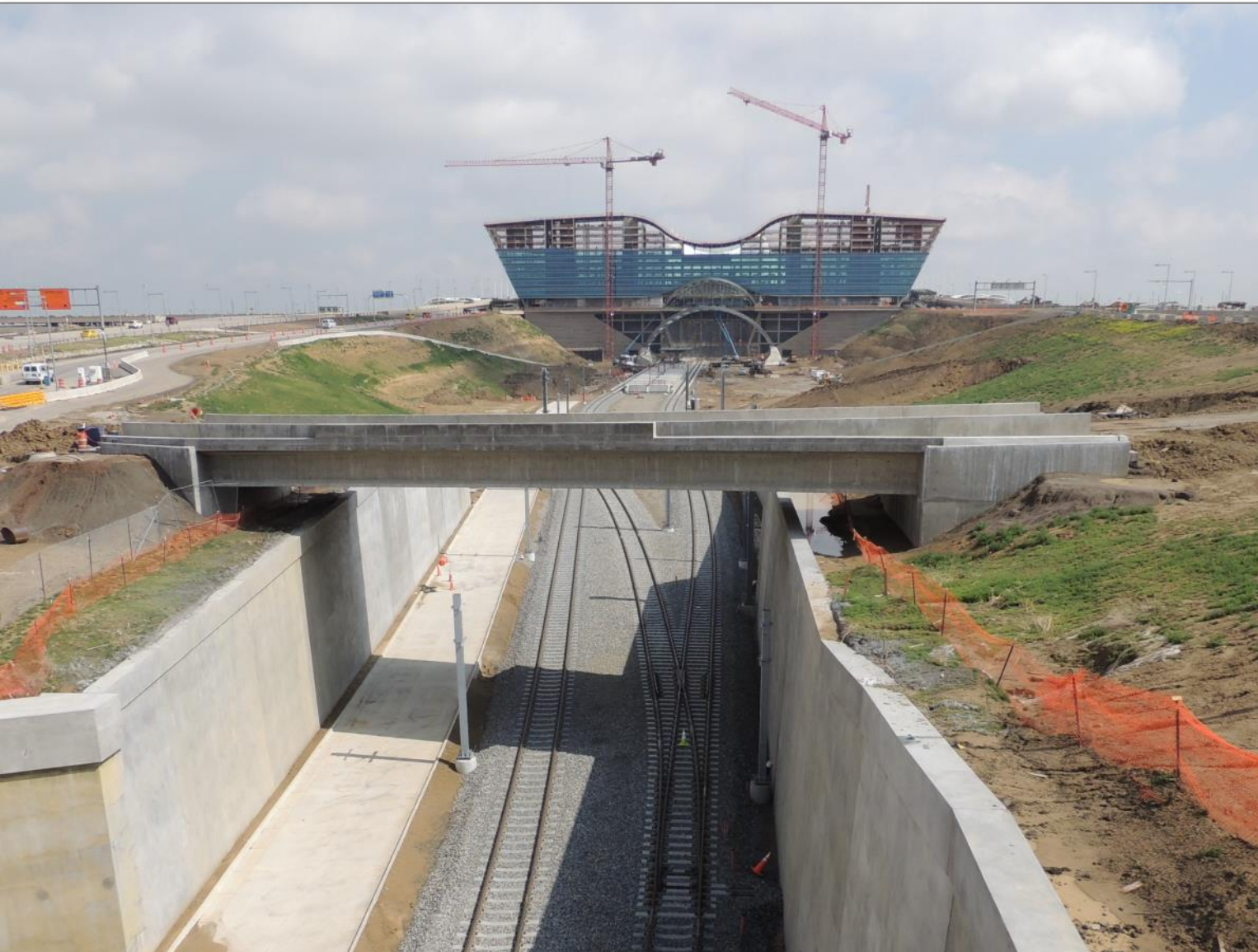
View north from Peña Boulevard outbound drive, above "X Box"