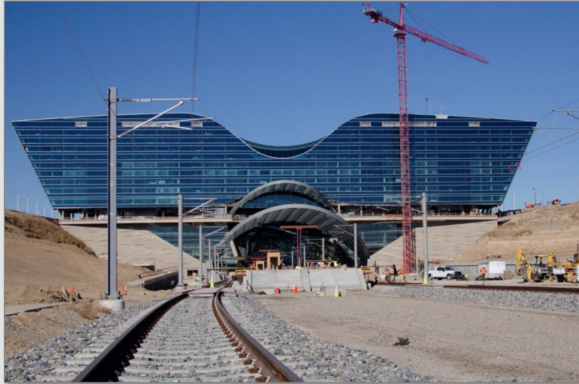
Overhead contact system (OCS) is complete near the Denver Airport Station, as well as the track work and most of the platform