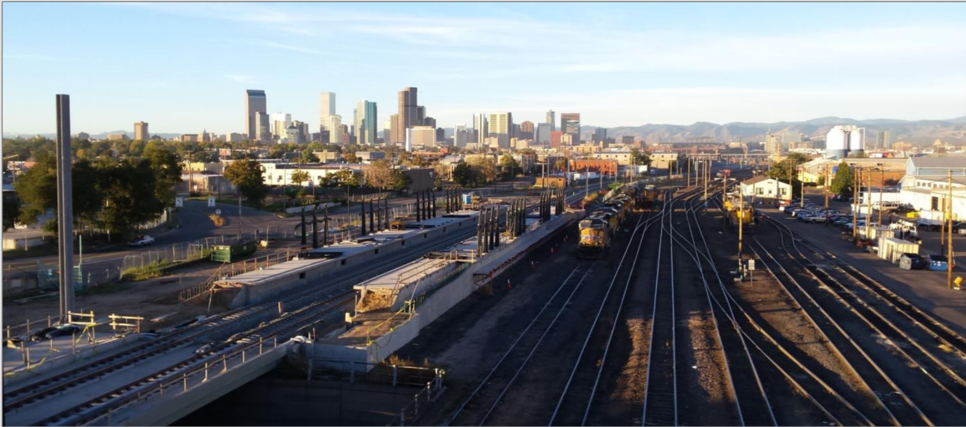
38th/Blake Station platform looking toward downtown