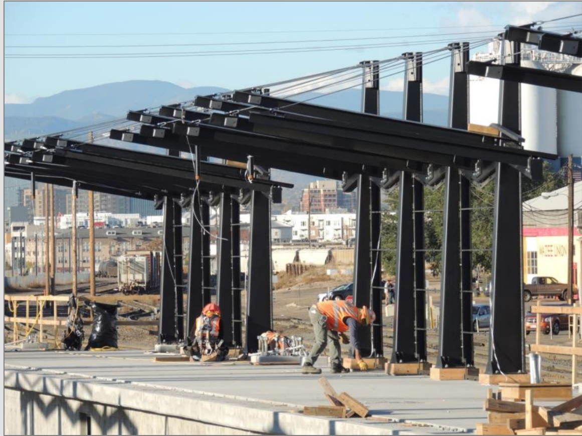
Workers install canopies on the 38th/Blake Station platform