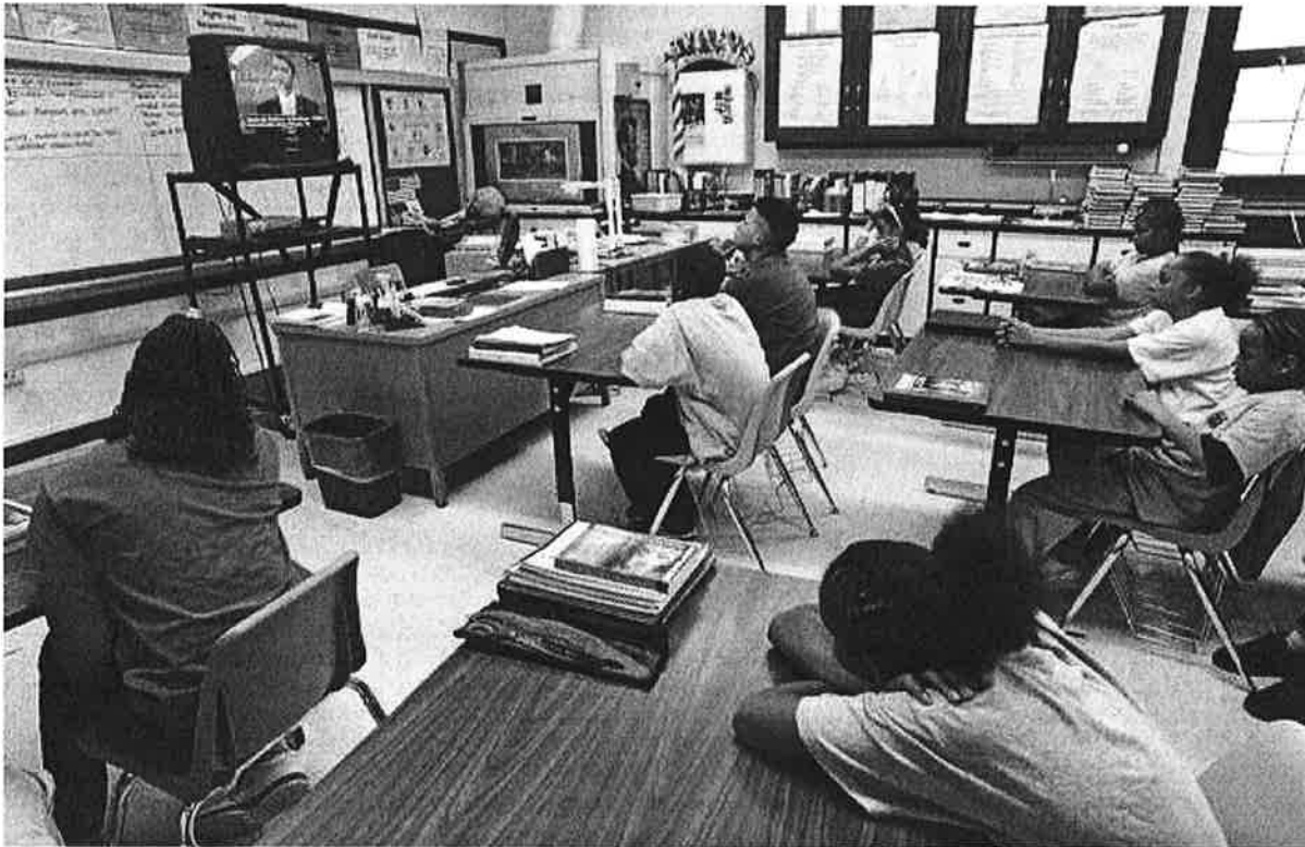
FILE — Sixth and Eighth graders pile into a history classroom at Smiley Middle School in 2008 to watch a speech by President Barack Obama.

A plan to shut down an underperforming middle school in Park Hill and replace it with a nearby Stapleton campus has tensions running high among neighborhood parents.